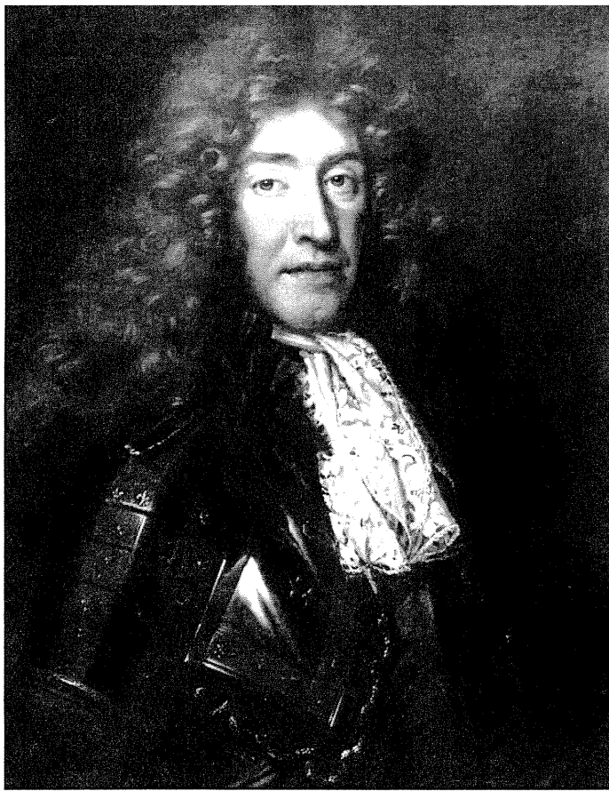
To this day, historians debate whether English King James II (1633–1701) wanted to just establish religious toleration for Catholics or to turn England into a centralized Catholic state.